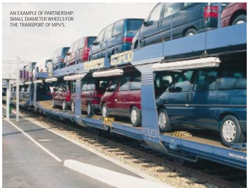
AN EXAMPLE OF PARTNERSHIP: SMALL DIAMETER WHEELS FOR THE TRANSPORT OF MPVS.

axles and wheelsets whose geometry and mechanical properties perfectly fulfil the operators' requirements. These advantages are particularly significant in the fields of heavy haul and intermodal transport. Forging near to net shape, closely controlled heat treatment and minimal machining of the quenched zone lead to an extension of the wheel service life.