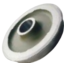
Wheel for intermodal traffic.