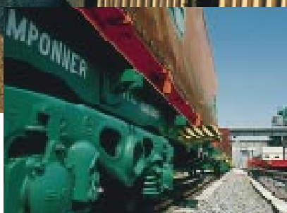
PIGGY-BACK UNITS: VALDUNES IS COMMITTED TO INTERMODAL TRANSPORT.

specialist as well as standard products with the same attention to detail and careful observation of international specifications.