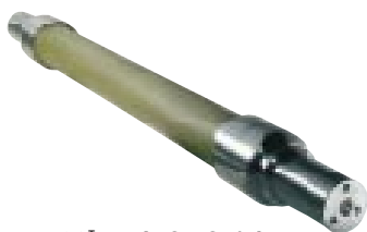
22 T 5 axle for freight cars.