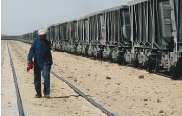
FROM THE TUNDRA TO THE DESERT, VALDUNES' WHEELS ARE DESIGNED FOR EXTREME CONDITIONS.