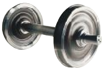
Wheelset for freight-car. Valdunes also carries out assembly of brake discs and bearings.